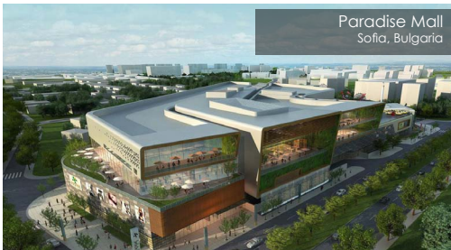
Paradise Mall Sofia, Bulgaria