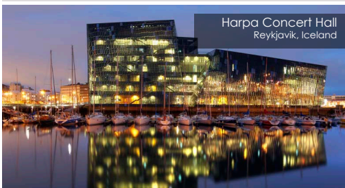
Harpa Concert Hall Reykjavik, Iceland

Big or small, near or far, Rapidrop provides solutions to the fire detection and suppression industry regardless of size or location.