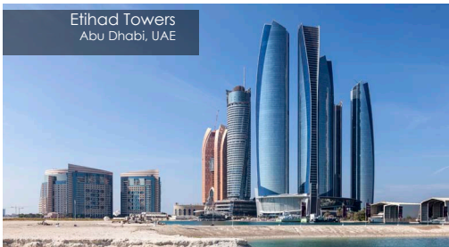
Etihad Towers Abu Dhabi, UAE