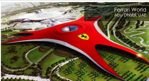
Ferrari World Abu Dhabi, UAE