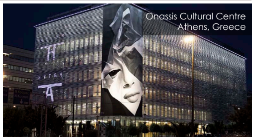
Onassis Cultural Centre Athens, Greece